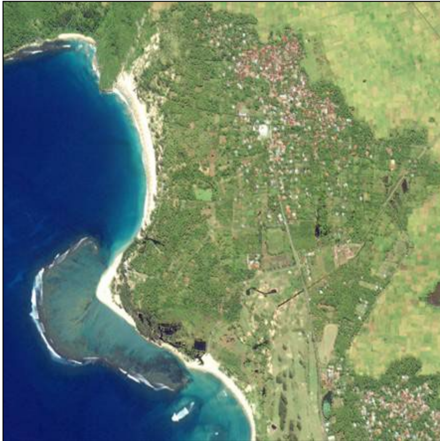
Before the tsunami. January 10 th , 2003

What do you think these satellite images show?