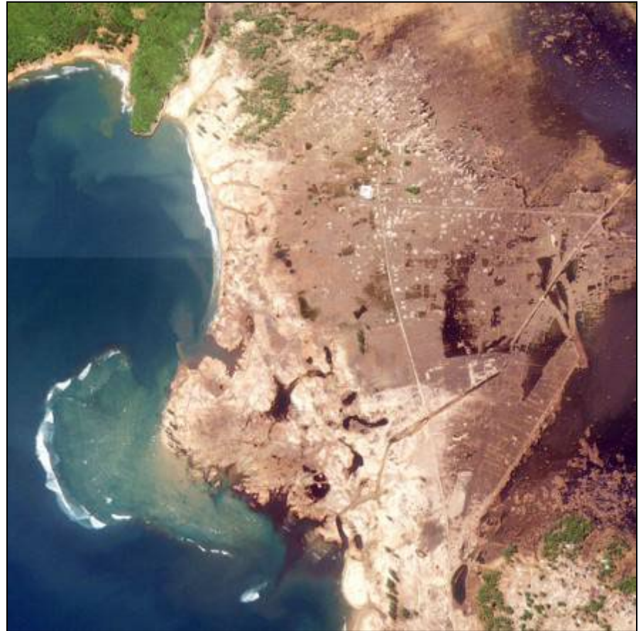
After the tsunami. December 29 th , 2004